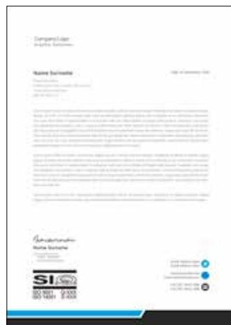
Business letters and other documents