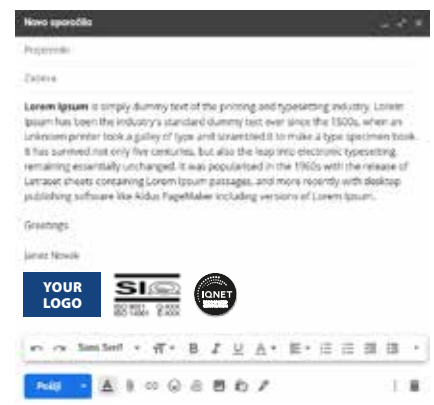
Signature in an e-mail